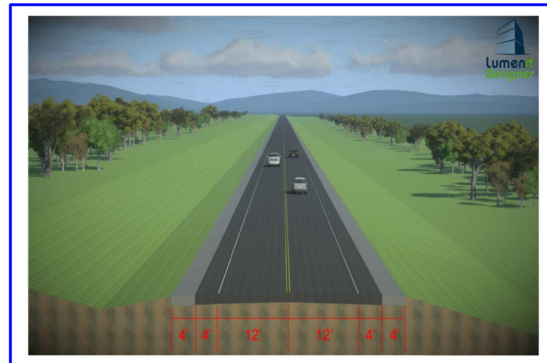
Rural 2-Lane Section Without Shared Used Path