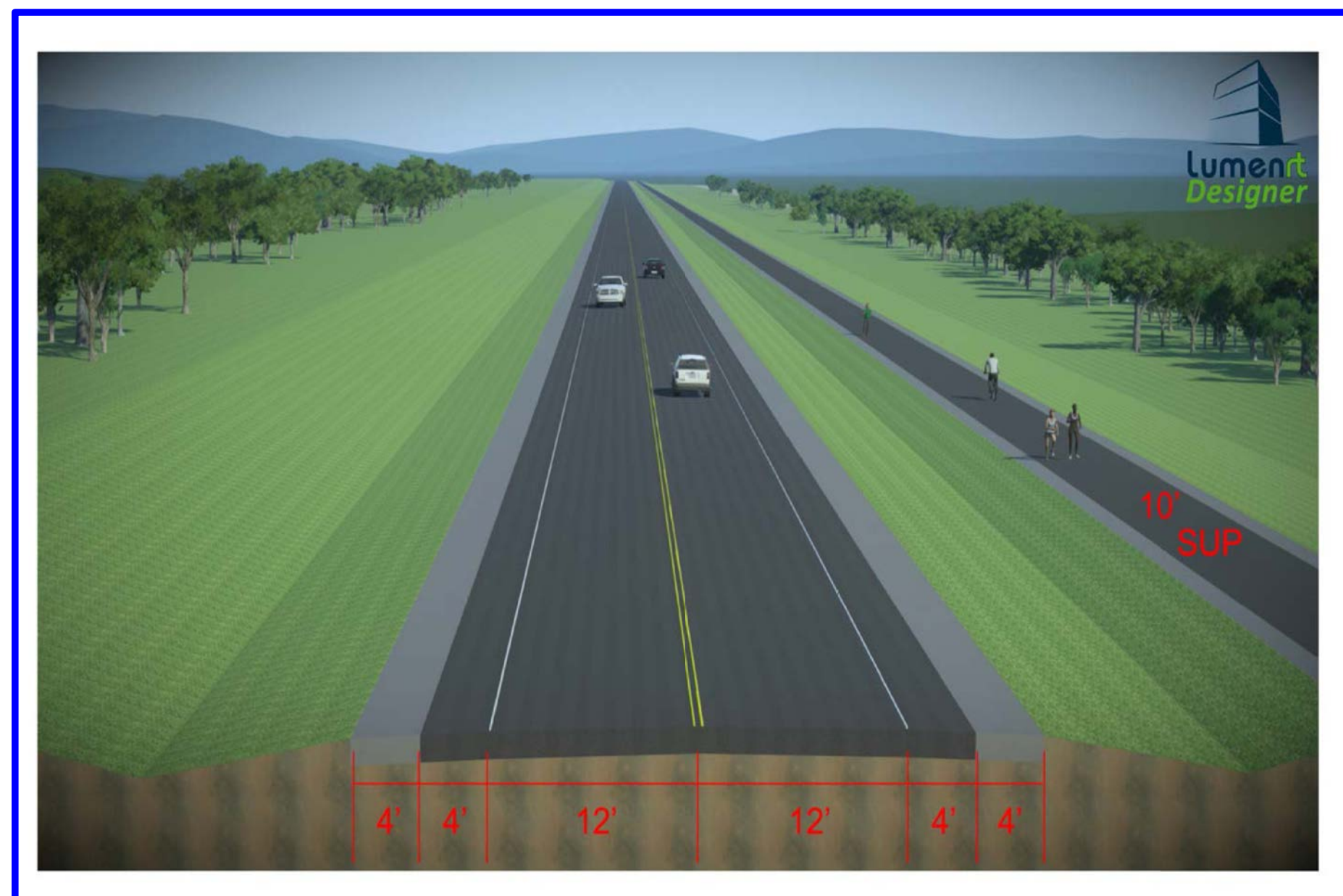
Rural 2-Lane Section With Shared Used Path