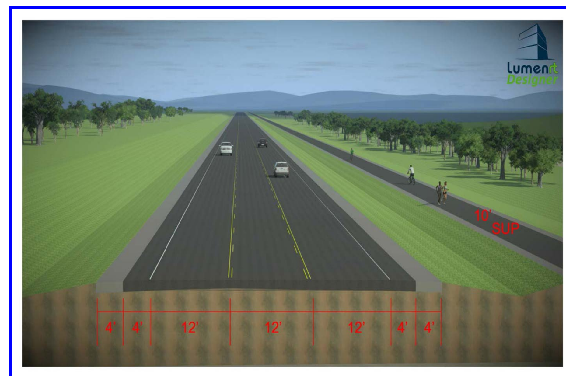
Rural 3-Lane Section With Shared Used Path