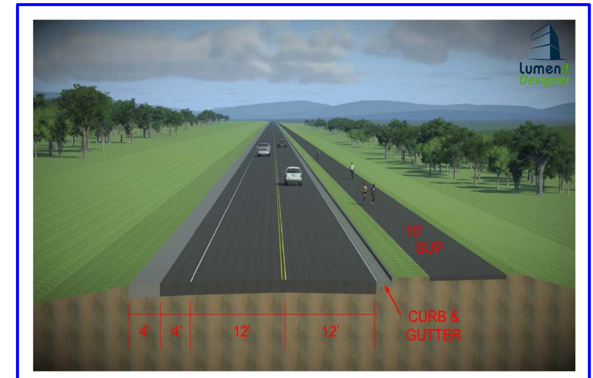
Hybrid Section With Curb & Gutter and Shared Used Path